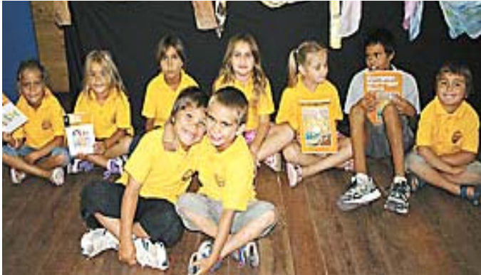
ABOVE: Point Pearce school Children at the launch

On Friday, 9 February 2007, I was pleased to have the opportunity to attend the official launch of the new Narungga language resources, held at the Moonta Town Hall.